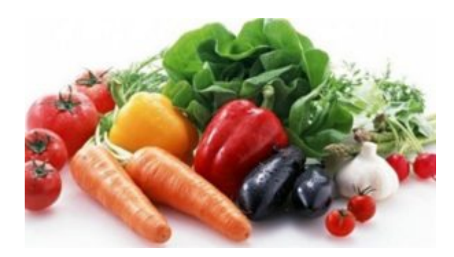
IPU Basics in Health and Nutrition